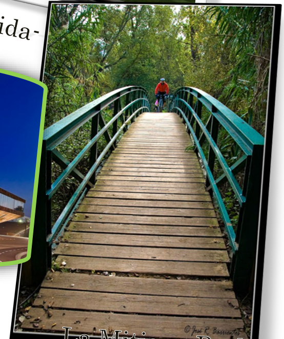
La Mitjana Park