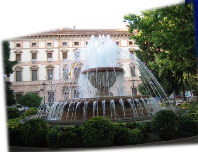
Fontaine Square La Pau