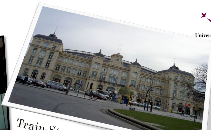
Train Station Lleida-