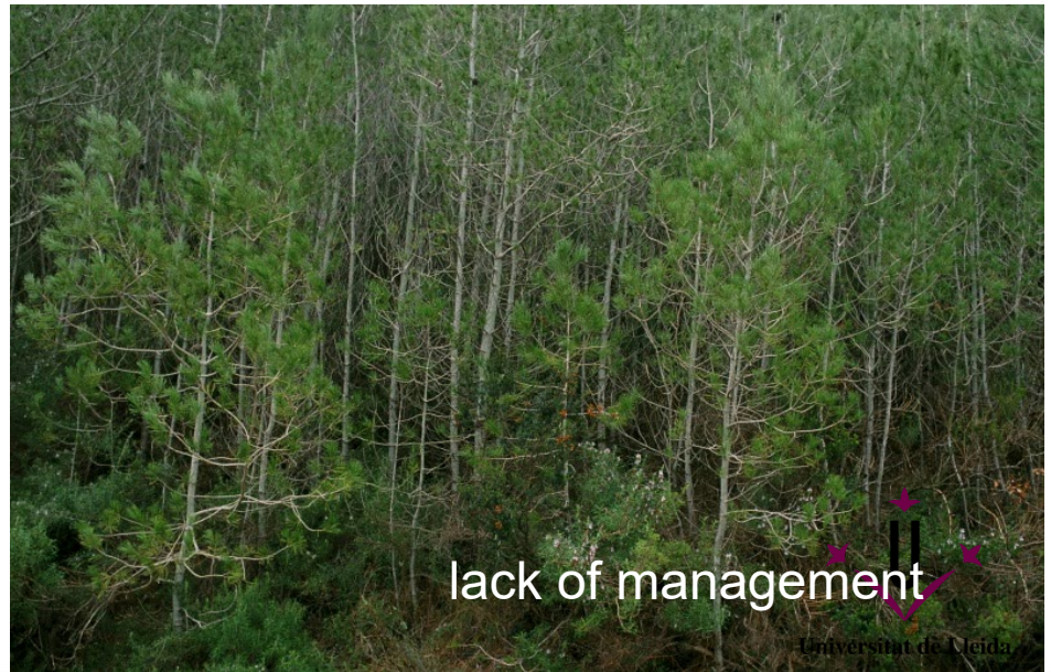
lack of management

Recently developed young forests challenging for silviculture and forestry