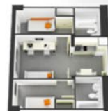
Dos habitaciones individuales