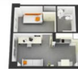
Adaptados de una habitación