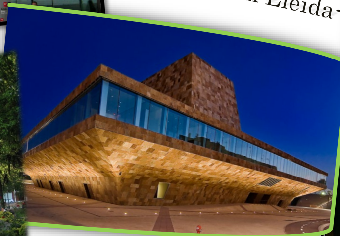
La Llotja Congress Hall