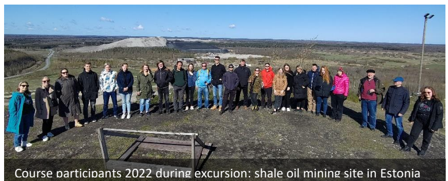
Course participants 2022 during excursion: shale oil mining site in Estonia

Outmigration, loss of local services and ageing populations accompanied by an economic downturn are a harsh reality for many Nordic/Baltic rural regions and communities. While new growth is often aimed for in these places, realities in the Nordic context, but also elsewhere have so far rendered these re-growth approaches largely wishful thinking. The acceptance of these realities has infused alternative ways such as “smart shrinkage” to local development. It provides an approach that accepts de-population and employs it actively to create smaller but better living places. The course directly engages with this novel concept to assess its potentials, challenges but also its pitfalls when applied in a rural context in Lithuania and Latvia.