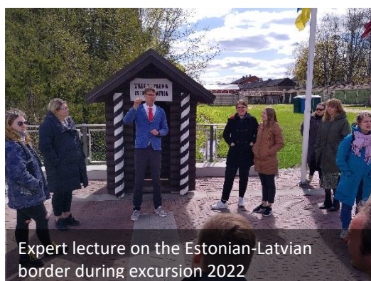
Expert lecture on the Estonian-Latvian border during excursion 2022