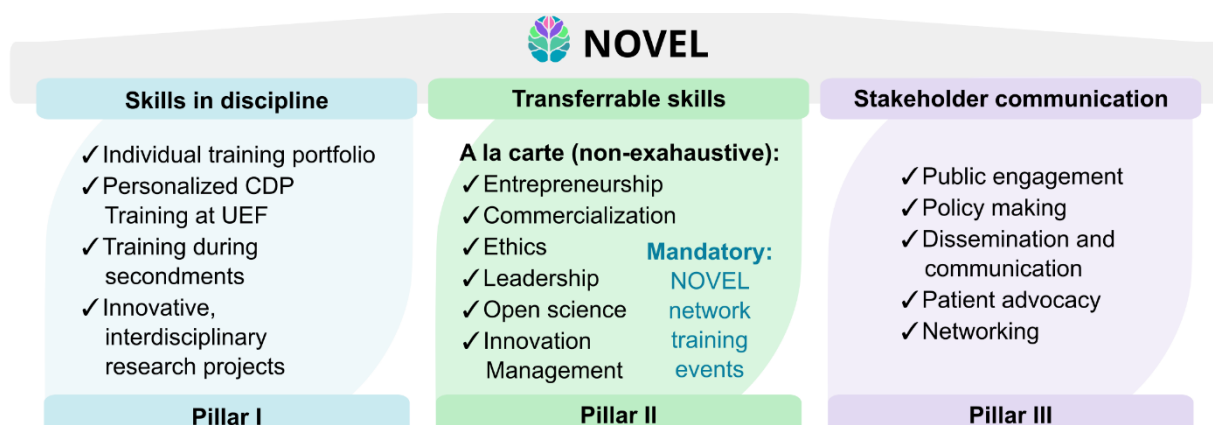
Figure 2. Outline of the NOVEL training pillars

Postdoctoral researchers are expected to participate in training activities and NOVEL community's events and meetings. Mandatory training activities include: