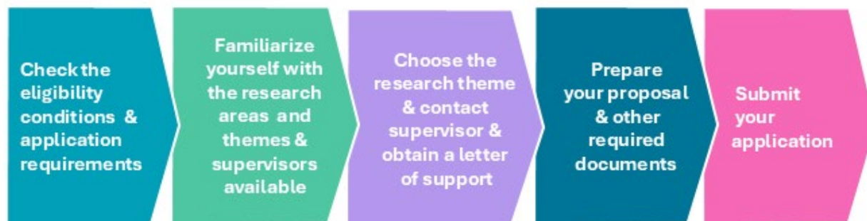
Figure 3. Outline of the NOVEL application process

The application process can be summarized as follows: